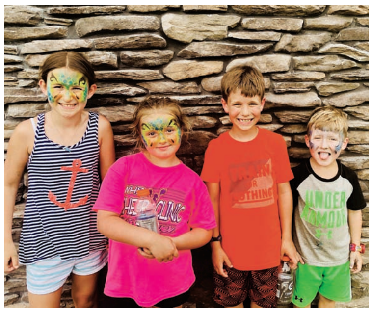
FIRST ANNUAL KICK-OFF TO SUMMER EVENT, See the fun on p.2

See inside for a list of all those who made June 2 possible and enjoy the pictures!